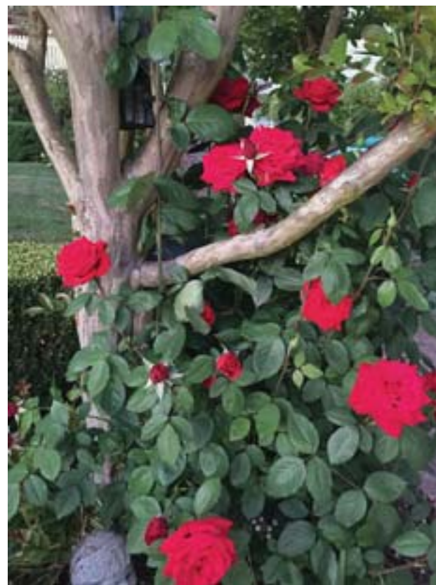
Roses are excellent fire-safe plants. (Mr. Lincoln rose)

Carob Strawberry Tree Redbud Honey Locust Chinese Pistache California Black Oak Sumac Yucca Joshua Tree